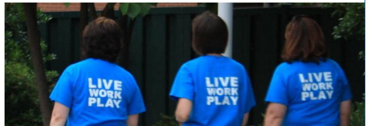
Relay for Life 2008

City People will have their first 1 Mile Certified Run on June 5, 2009. The City People Downtown Dash is designed for the elite and the recreational runners. Cost is $15 per person by May 31 st or $20 per person the day of the race. City People will have their first 1 Mile Certified Run on June 5, 2009. You can get more information on our website as well as register online at www.citypeople.org . If you have questions, you can email us at citypeople.knox@gmail.com . We will get back to you as soon as we can with the answers to your questions. Registration will take place at the Daylight building on Union (across from Pete's) beginning at 5:00pm. Volunteers are needed to help with Registration (5:00pm til 6:30pm and you can run in the race!) and Course Monitors. If you would like to volunteer, please contact us at our email above. The race will begin at 7:00pm for Elite runners and 7:05pm for Open runners. Join us for awards in Krutch Park Extension at 7:45pm.